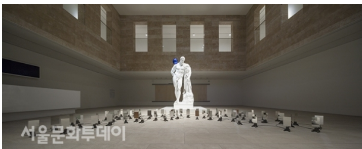
Audition