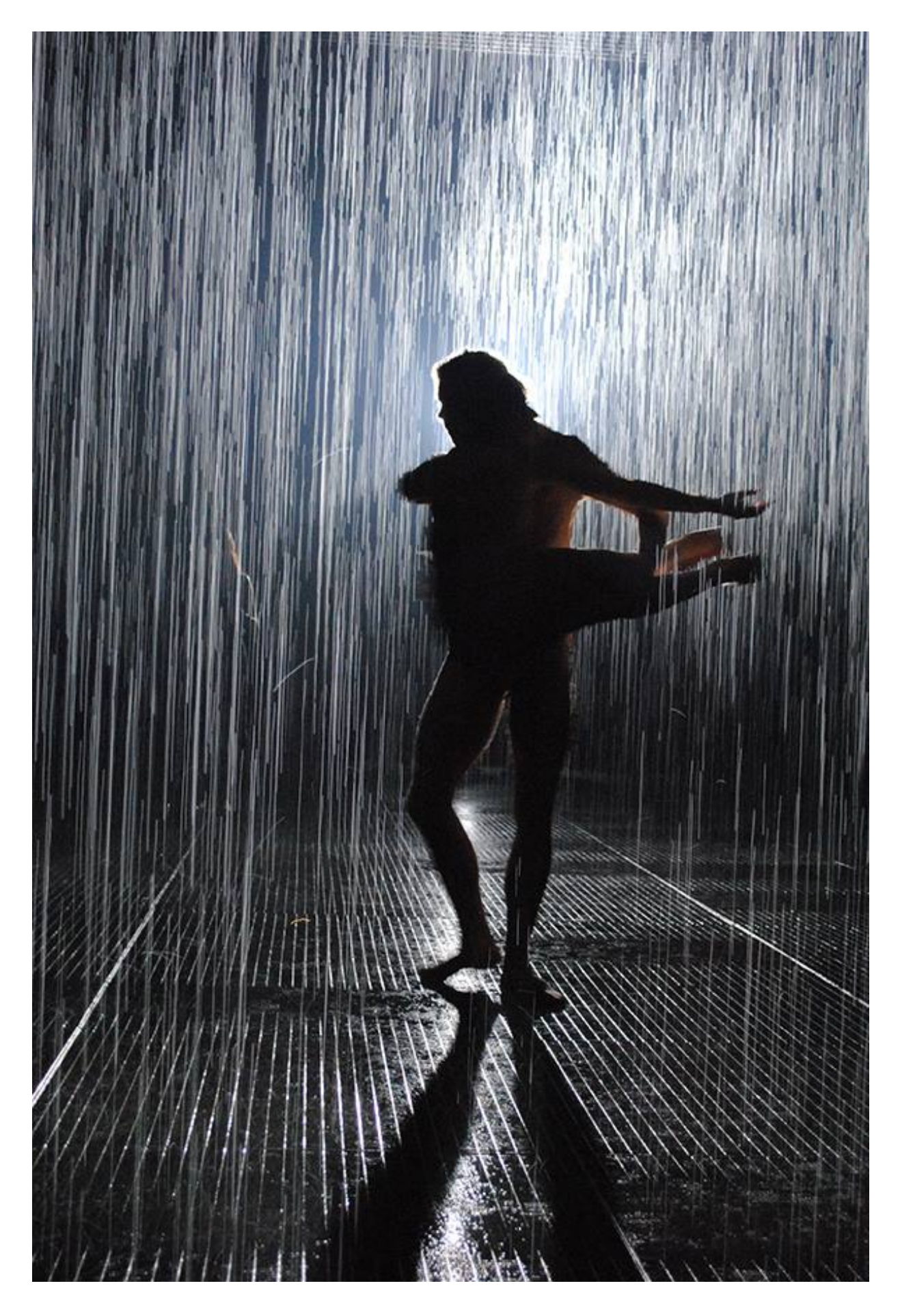
Random Dance at the Rain Room, Yuz Museum, Shanghai, China, Photo P A Black © Artlyst 2015.

Guests at the opening had their own experiences of the interaction, being the first to enjoy the juxtaposition between the seemingly natural elements and the technology to control them; but more so, to experience the seemingly God-like ability to stand in the rain and have it bend around you. The Rain Room offers a highly visceral experience for the viewer with an immersive quality offering global appeal.