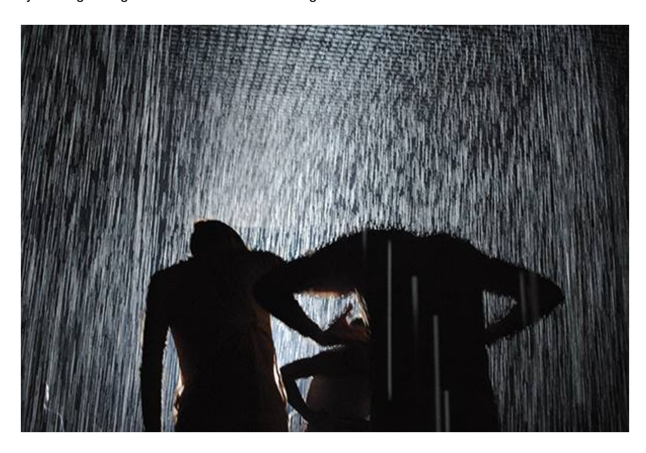
Random Dance at the Rain Room, Yuz Museum, Shanghai, China, Photo P A Black © Artlyst 2015.

The guests at the opening gala event were treated to a special performance by Wayne McGregor's Random Dance, where the dancers interacted with both the kinetic movement of the Rain Room, and the viewers who were tentatively walking through Random International's magical installation.