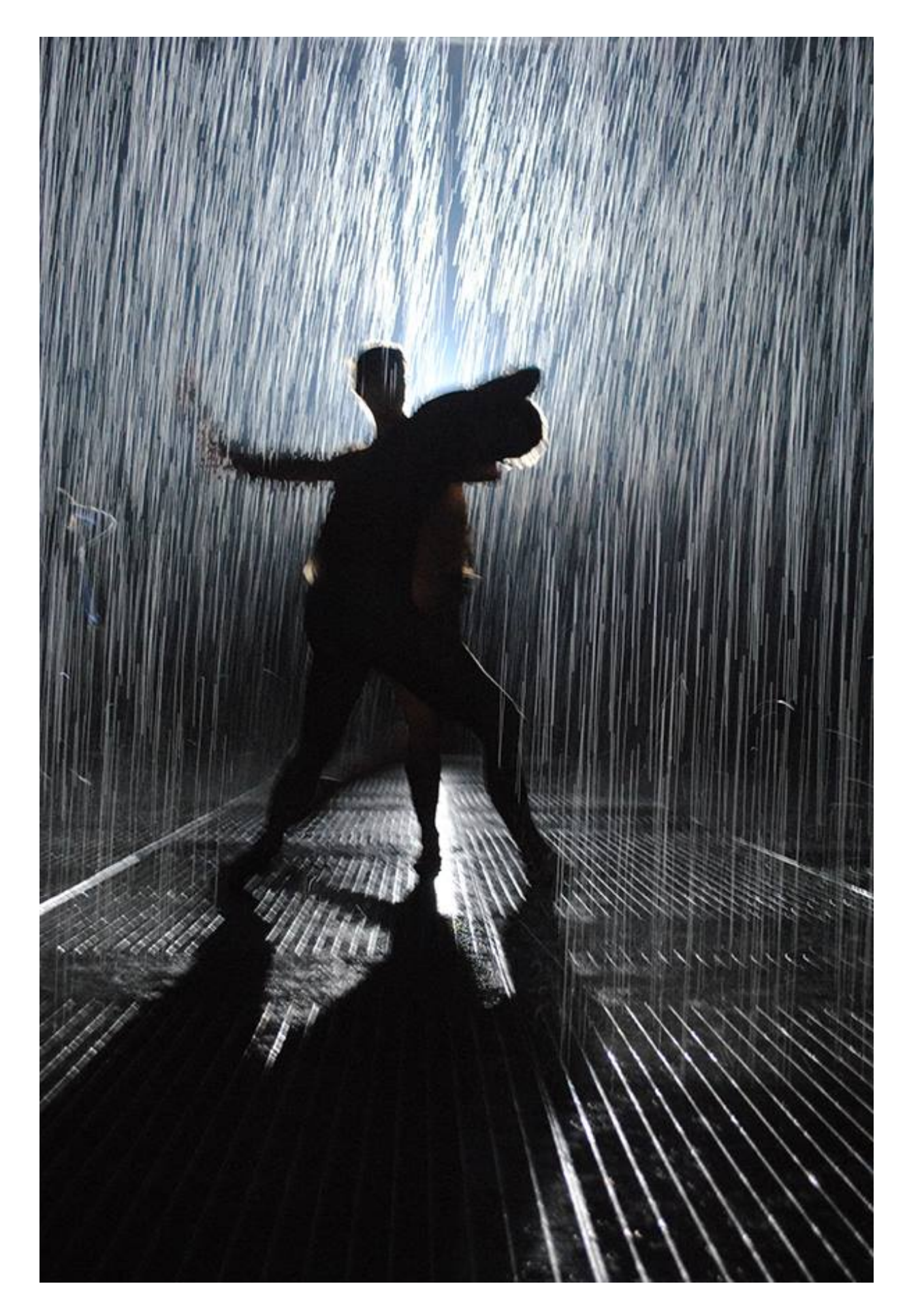
Random Dance at the Rain Room, Yuz Museum, Shanghai, China