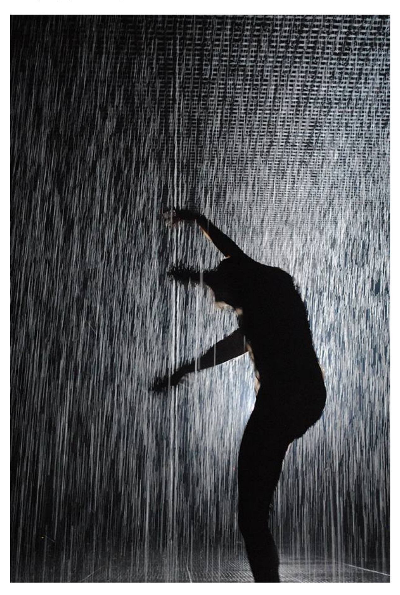
Random Dance at the Rain Room, Yuz Museum, Shanghai, China, Photo P A Black © Artlyst 2015.

the importance of water to the people of Shanghai, which is one of the most polluted cities in the world with a perpetual smog hanging in its atmosphere.