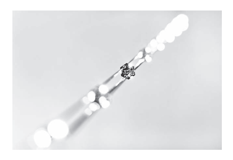
detail of FUTURE SELF [work in progress], commissioned by MADE Berlin