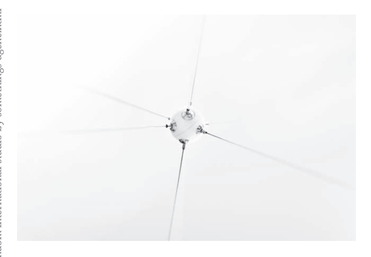
detail of FLY , commissioned by Rachel Verghis / Incubator

special thanks to Heloise Reynolds